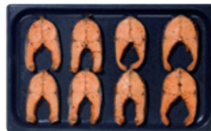
GN 1/1 crosswise insertion

Your benefits: a huge plus in capacity as well as increased productivity. Our flexibility concept speeds up all of the various processes in professional kitchens. And you not only save time, but valuable energy as well.*